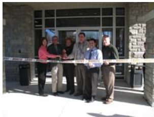
Leamington Area Family Health Team building grand opening Nov. 13, 2009

When completed the Leamington Medical Village will include an additional separate 25,000 sq. ft. building housing healthcare related businesses. For leasing information contact Amico Design Build at 519-737-6299 or Louis Saad at Realty House 519-322-2233.